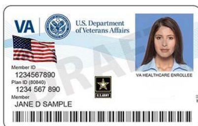
U.S. Department of Veterans Affairs identification card