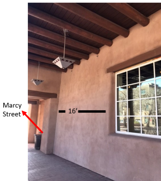
Portal/Community Gallery Wall Located off of Marcy Street