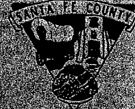
EXHIBIT tabbles 2