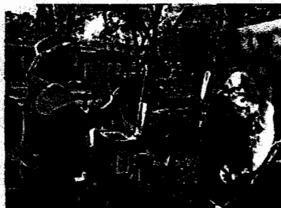
Artist Natasha Isenhour in 2012