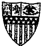
EXHIBIT 4 City Council - Jan. 8, 2020