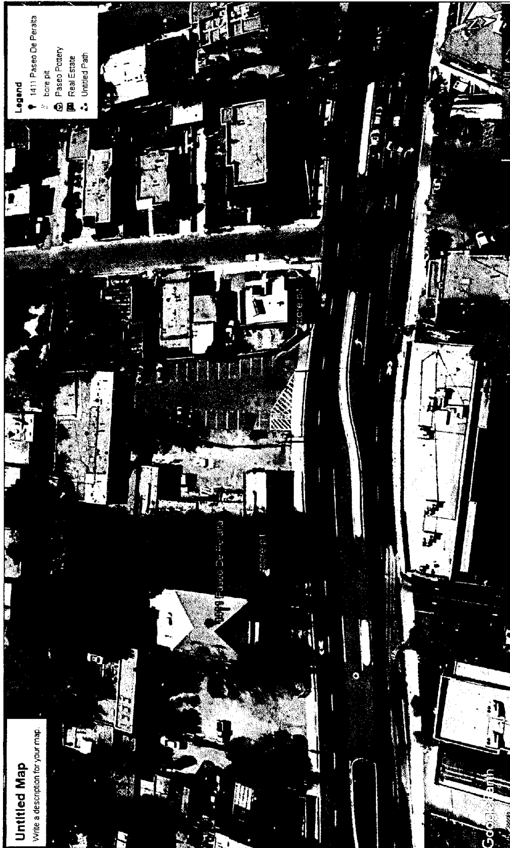
Figure 2: Location of Proposed Bore Pits