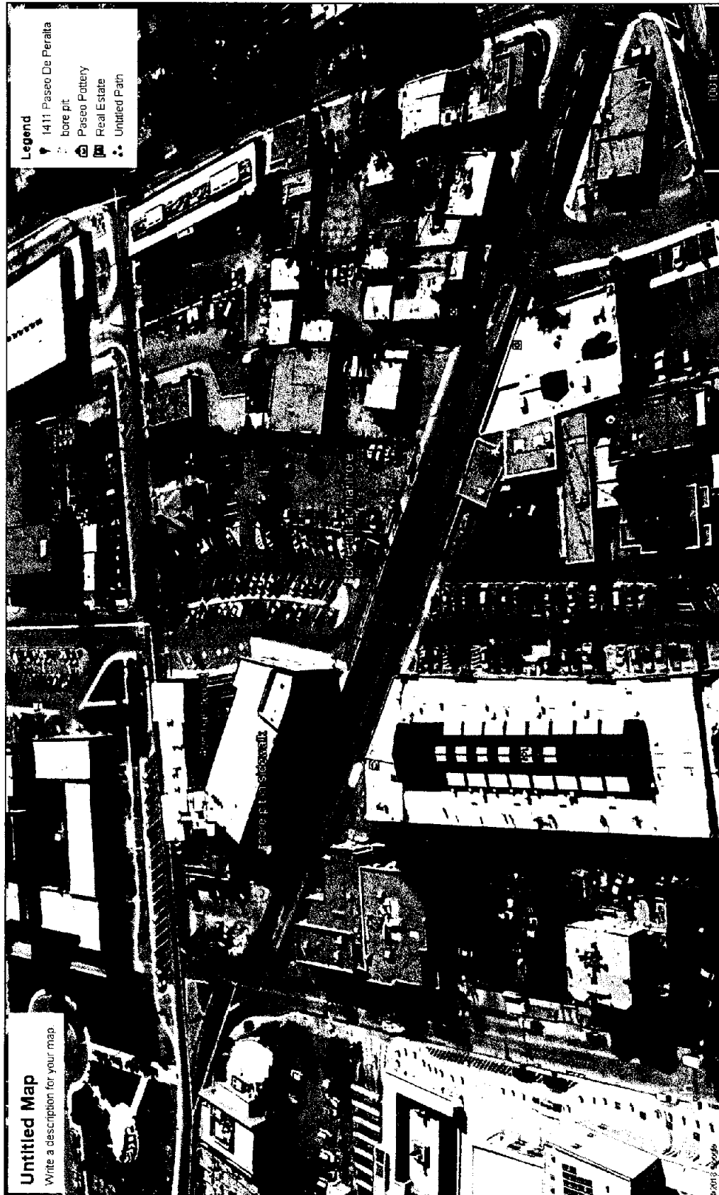
Figure 2: Location of Proposed Bore Pits