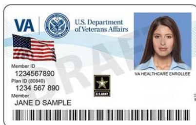
U.S. Department of Veterans Affairs identification card