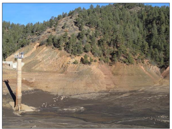
McClure Reservoir Fully Drained with Santa Fe River Flowing Directly Through Outlet. Photo 11/6/2014

McClure Reservoir draining was completed on October 31, 2014 with Santa Fe River flow going directly into the outlet conduit and through the dam. A Notice to Proceed with McClure Reservoir construction was issued to RMCI, the construction contractor, on November 7, 2014 rather than on September 2, 2014 as originally planned. It is anticipated that RMCI will mobilize for work on or about March 2, 2014 and construction will be completed by November 27, 2015. McClure Reservoir will then be ready to receive 2016 spring and summer runoff.