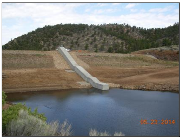
Nichols Dam Inclined Intake Structure. Reservoir Being Refilled. Photo 5/23/2014

Work at Nichols Reservoir began September 3, 2013 and was substantially completed in mid-May 2014, when filling of the reservoir began. Nichols Dam and Reservoir is back in service and is supplying water to the Canyon Road Water Treatment Plant.