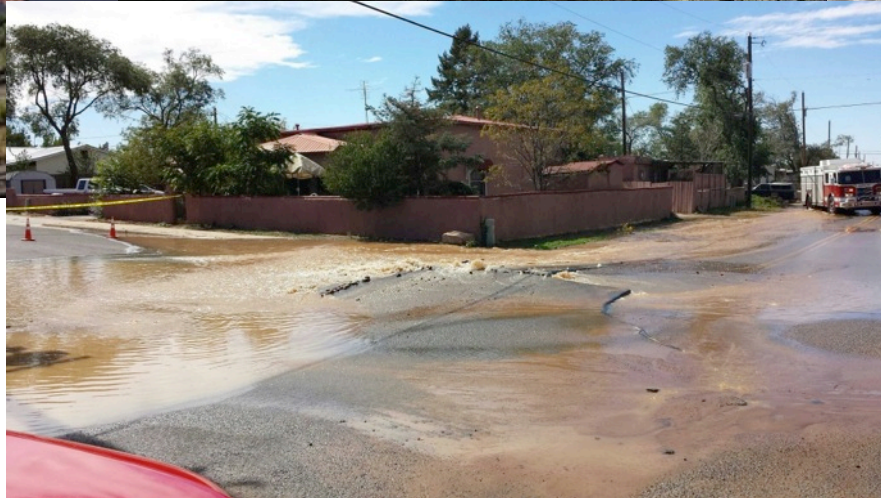
2013 Water Main Break in Santa Fe, NM