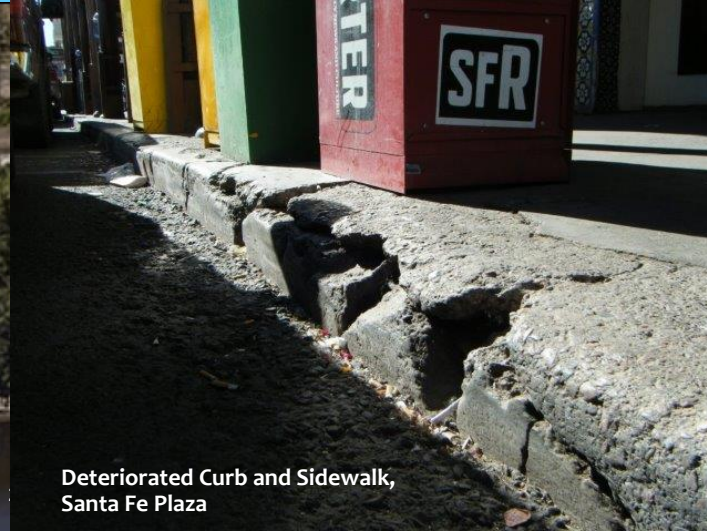
Deteriorated Curb and Sidewalk, Santa Fe Plaza